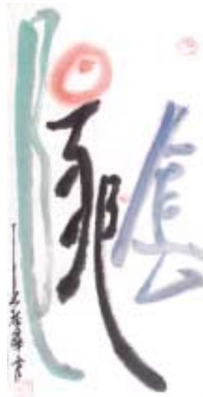
'Half Calligraphy Half Painting' (Panhua Pansu) Representation of Yin•Yang Integrative Coloration